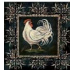
"Black and White Rooster I"