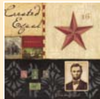
"Created Equal" (new release)