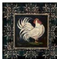
"Black and White Rooster II"

"I find that the simple life exists not only in a place or period of time but also in our hearts," she says. "Through art, the gentler times can always touch our lives."