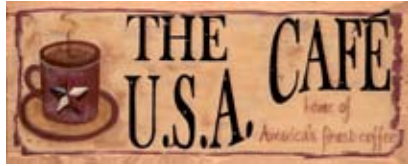
"The USA Cafe"